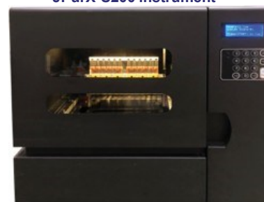
Standalone automated system with LCD graphic interface