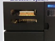
Standalone automated system with LCD graphic interface