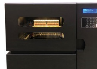
Standalone automated system with LCD graphic interface